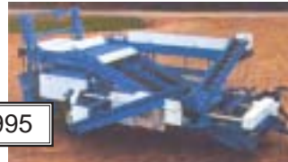
HarvestAire Ginseng Harvester AE50 & Governor's New Product Certificate of Merit