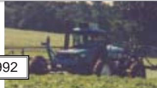
AireGlide Self-Propelled Sprayer Governor's New Product Certificate of Merit