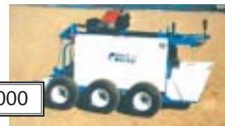
BeachMaster™ Walk Behind Beach Cleaner AE50 Award