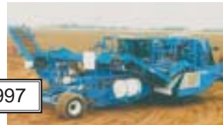
Self-Propelled Harvester AE50 Award