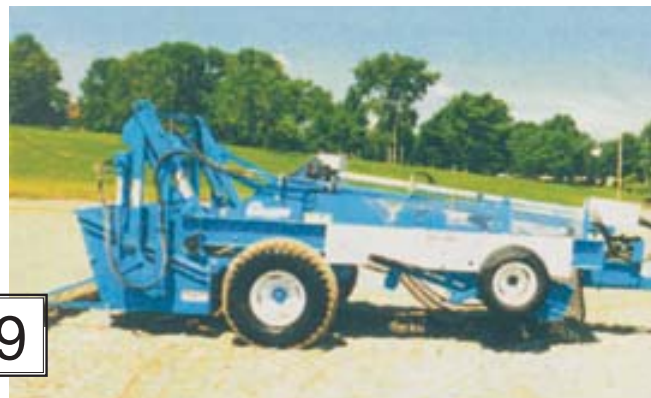
BeachMaster™ Beach Cleaner AE50 & Governor's New Product Award