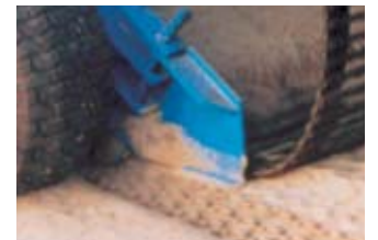
BeachMaster's Patent-pending sweeping system provides 100 percent surface contact.

1998 AE50 Award Recipient for Outstanding Innovations in Product or Systems Technology by Resource: Engineering & Technology for a Sustainable World.