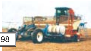
Pusher Unit AE 50 Award