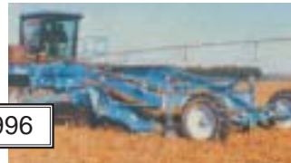
Self-Propelled Windrower AE50 & Governor's New Product Certificate of Merit