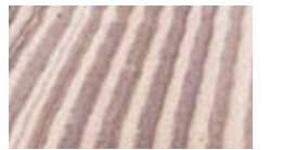
The standard grooming attachment creates a beautiful finish.